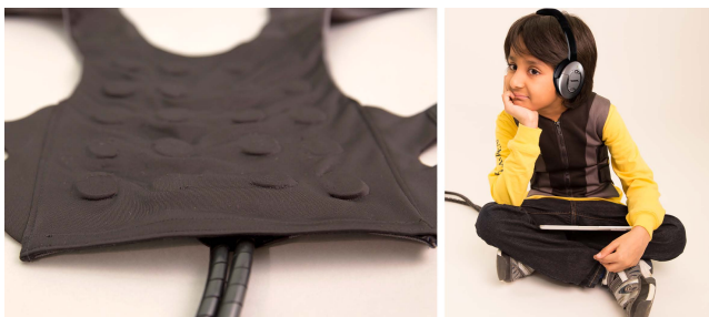
Figure 1: Vest with 20 embedded actuators and story-listening setup

Haptic patterns were presented by means of a custom-made child-size vest with flexible back fabric and open sides, capable of adjustment to allow maximum back contact for a range of chest and waist sizes. A 4 (row) \times 5 (column) array of twenty vibrotactile actuators, or tactors (type C-2, Engineering Acoustics INC., Florida, USA) were sewn into small pockets on the inside of the vest, directly in contact with the child’s back. Tactor actuation was achieved via an original iPad Mini application and Wi-Fi communication. The children wore BOSE noise-cancelling headphones to listen to the story and mask motor noises produced by the tactors.